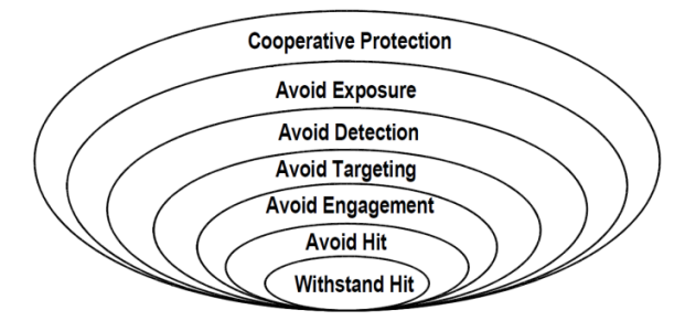
Figure 1. The Survivability Onion, re-drawn from Guzie (2004: 11).

The quantitative measure to chose depends on how the mission is defined and what should be measured. A quantitative study could give insight to mechanism linking a specific type of attack to the survivability for a specific type of ship. An insight very much needed as survivability in the general case is not only a question of having the right weapon systems or soft kill system, it can, as the NSC (NSA 2010) defines, be described in terms of the susceptibility, vulnerability, and recoverability of the system. Susceptibility describes how easily the ship can be detected including tactical measures. Vulnerability is the inherent ability of the sip to resist damage. Recoverability is the ability of the ship and its crew to sustain operational capability. All three aspects are a function of technology, tactics and efforts done onboard. Survivability can also be described and analysed by layers of protection, the Survivability Onion, see figure 1 (Guzie 2004: 11).